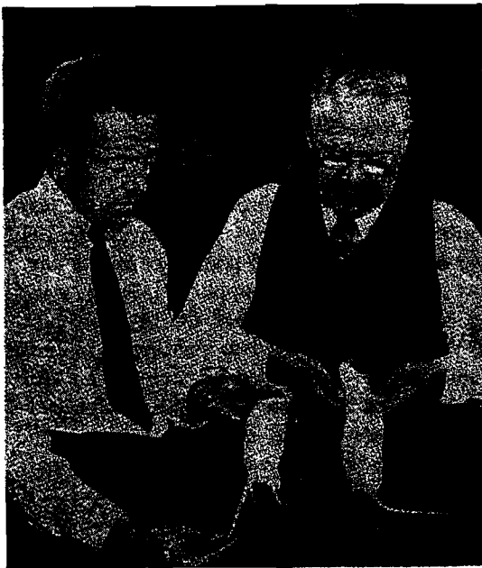
White rat experiments by U. S. Department of Agriculture clearly show how lack of trace minerals affect health of animals.